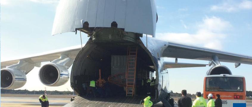
On-site witness for the loading of sensitive cargo aboard an airplane