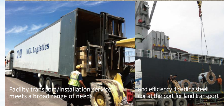
Facility transport/installation service and efficiency: Loading steel coil at the port for land transport meets a broad range of needs.