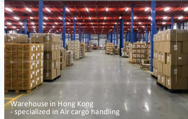
Warehouse in Hong Kong - specialized in Air cargo handling