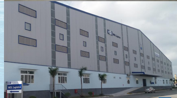
Haiphong Logistics Center — opened in January 2019 near the Port of Haiphong, Vietnam.