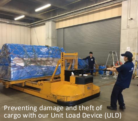
Preventing damage and theft of cargo with our Unit Load Device (ULD)