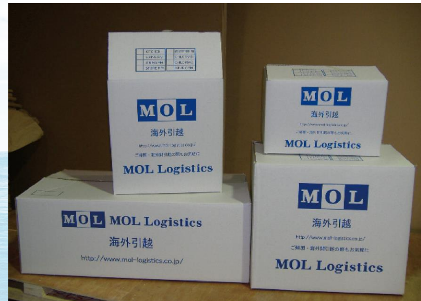
MOL Logistics protects valuable household goods with its exclusive shipping cartons.