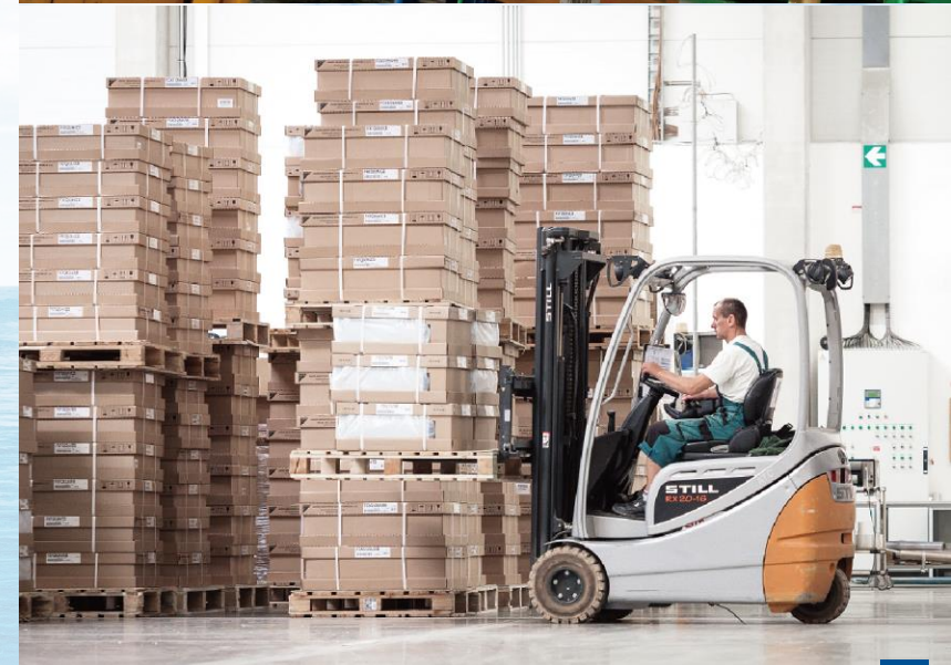
MOL Logistics (Czech) is expanding its contract logistics business.