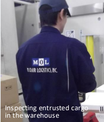
Inspecting entrusted cargo in the warehouse