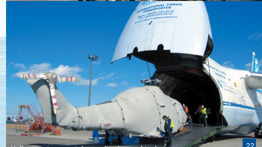
Helicopter transport demands advanced techniques.