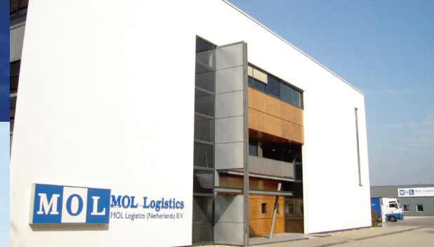
Warehouse in Tilburg, the Netherlands