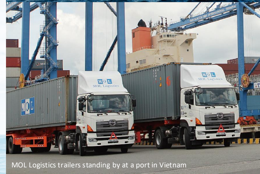
MOL Logistics trailers standing by at a port in Vietnam