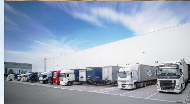
Expanding our contract logistics business with the Pilsen warehouse in Czech Republic