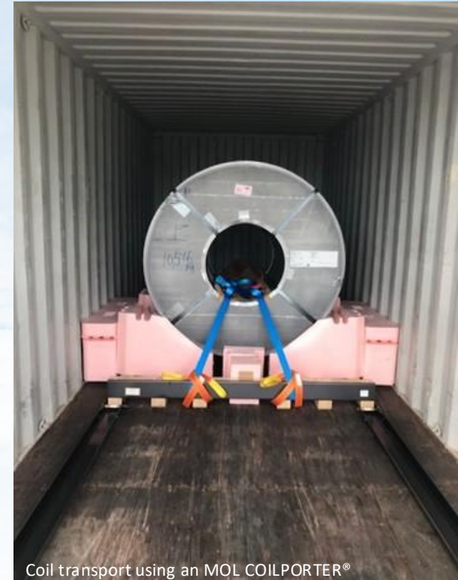
Coil transport using an MOL COILPORTER®