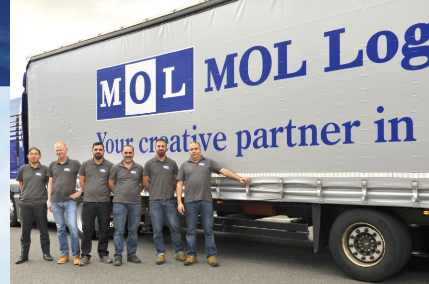
Operating our own trailers all over the world

In addition, MOL Logistics offers container transport services within the EU, and gateway services in Europe, Eastern Europe, and Russia.