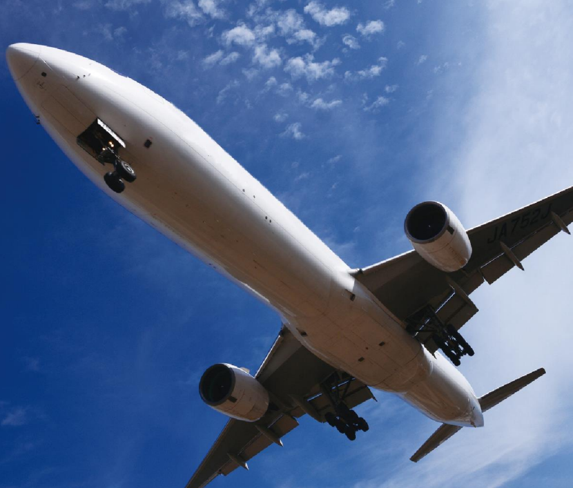
Reliable, trustworthy door-to-door integrated transport