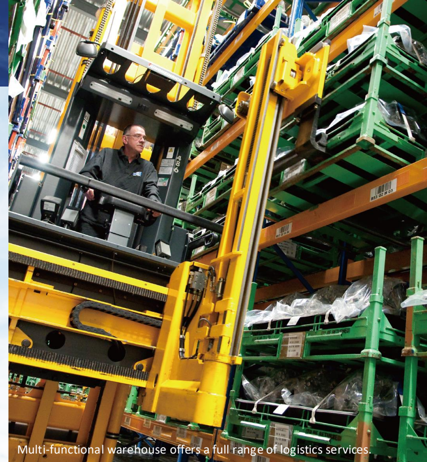
Multi-functional warehouse offers a full range of logistics services.