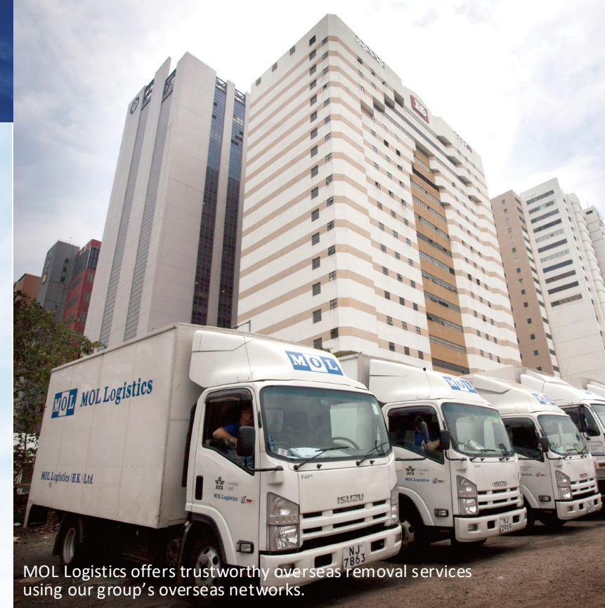
MOL Logistics offers trustworthy overseas removal services using our group's overseas networks.